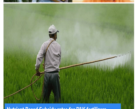
Nutrient Based Subsidy rates for P&K fertilizers

(A) The central government announced that the rate of nutrient based subsidy for phosphatic and potash fertilizers for this year's Kharif season will be increased to Rs 60,939 crore from April to September 2022, as against Rs 57,150 crore for the year 2021.